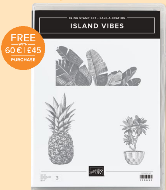
INK. ISLAND VIBES • 158096 FREE!

3 cling stamps (suggested clear blocks: d, e)